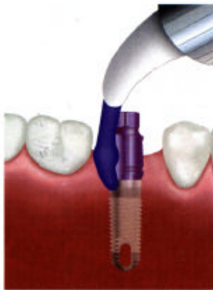
Fig 5: Making an immediate impression.