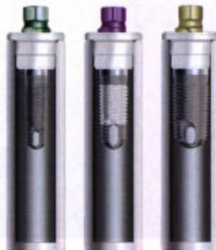
Fig 2: Fixture Mount/Transfers are colour-coded to indicate the diameter of the implant.