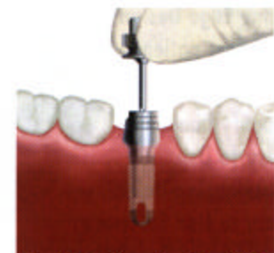
Fig 15: Delivering the definitive abutment at the second-stage uncovering.