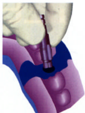
Fig 10: Completing the transfer with the Fixture Mount/Transfer and Implant Replica assembly.