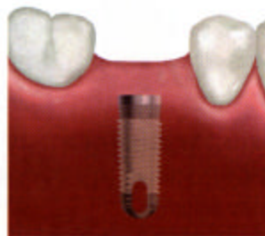
Fig 8: The implant is submerged beneath the soft tissue until osseointegrated.