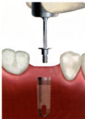
Fig 7: Attaching the surgical cover screw for a two-stage surgical protocol.

9. After verification of osseointegration at the stage-2 surgical uncovering appointment, thread the prepared abutment into the implant [Fig. 15] and tighten the abutment screw to 30 Ncm with a properly calibrated torque wrench.