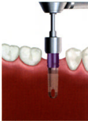
Fig 4: Seating the implant into the osteotomy.