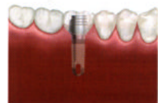
Fig 16: Delivering the provisional prosthesis at the second-stage uncovering.