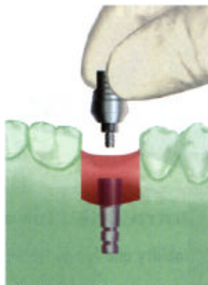
Fig 12: Attaching the Hex-Lock Abutment to the Implant Replica in the working cast.