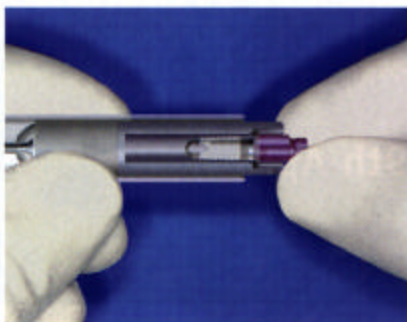
Fig 1: Double-vial implant packaging. Note that the sterile implant is preattached to the Fixture Mount/Transfer inside the storage vial.