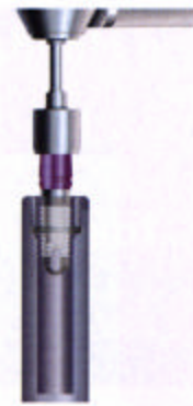
Fig 3: Removing the implant by the Fixture Mount/Transfer from its storage vial.