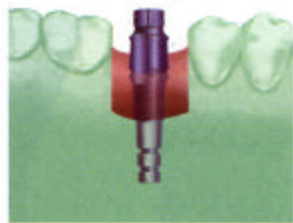
Fig 11: The Implant Replica is embedded in dental stone after pouring the transfer impression.