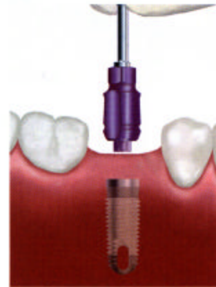
Fig 6: Removing the Fixture Mount/Transfer from the implant.

Mount/Transfer in a clockwise direction until the implant's threads engage the bone. Stabilize the fixture mount with powder-free, sterile-gloved fingers and momentarily remove the insertion instrument from the implant assembly, if used. While continuing to manually stabilize the implant assembly, insert a 1.25mmD Hex Tool into the top of the fixture mount, then loosen and retighten the screw holding the implant in place. Attach the ratchet or slow-speed handpiece to the Fixture Mount/Transfer and slowly rotate the assembly clockwise to screw the implant into place [Fig. 4].