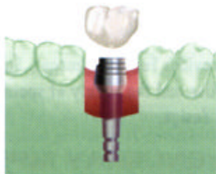
Fig 14: Fabricating the provisional prosthesis.