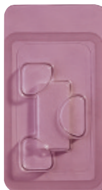
Cat. # 0101 CollaCote Dressing 3/4" x 1 1/2"