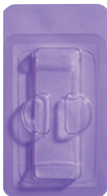
Cat. # 0100 CollaTape Dressing 1" x 3"

The absorbable collagen wound dressings are supplied in sterile, individual bubble packs in the following configurations: