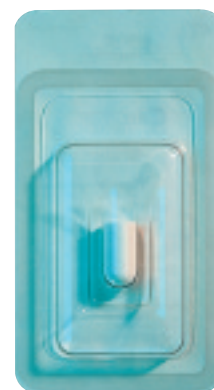
Cat. # 0102 CollaPlug Dressing 3/8" x 3/4"

Convenient dispenser box keeps Zimmer Dental wound dressings at your fingertips during procedures.