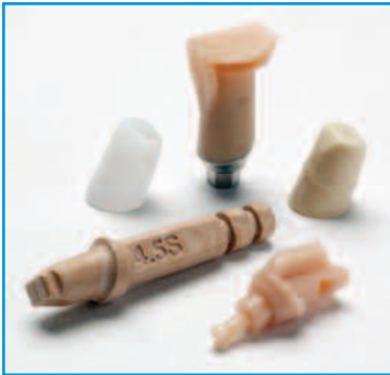
Contour Restorative Components

Hex-Lock Contour Abutments feature a pre-defined offset margin that is lower on the buccal aspect and higher on the lingual aspect. The abutments are contoured below the margin to create space for soft tissue without compromising strength. To resist rotational forces, the abutment's cone is non-cylindrical and features a vertical groove on the lingual aspect. Cuff height options include 1mm, 2mm and 3mm (buccal measurement) on the straight abutment and 1mm and 2mm on the 17° angled abutment.